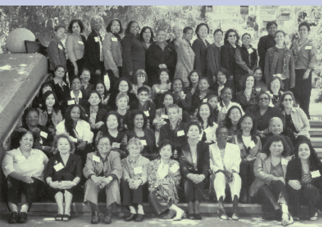
In May of 2004 we were proud to convene "On The Rise: A Celebration and Forum for Bay Area Women Executive Directors of Color", the first gathering of its kind, with 80 women executive directors of color (WEDOCs) and keynote speaker San Francisco District Attorney Kamala Harris.