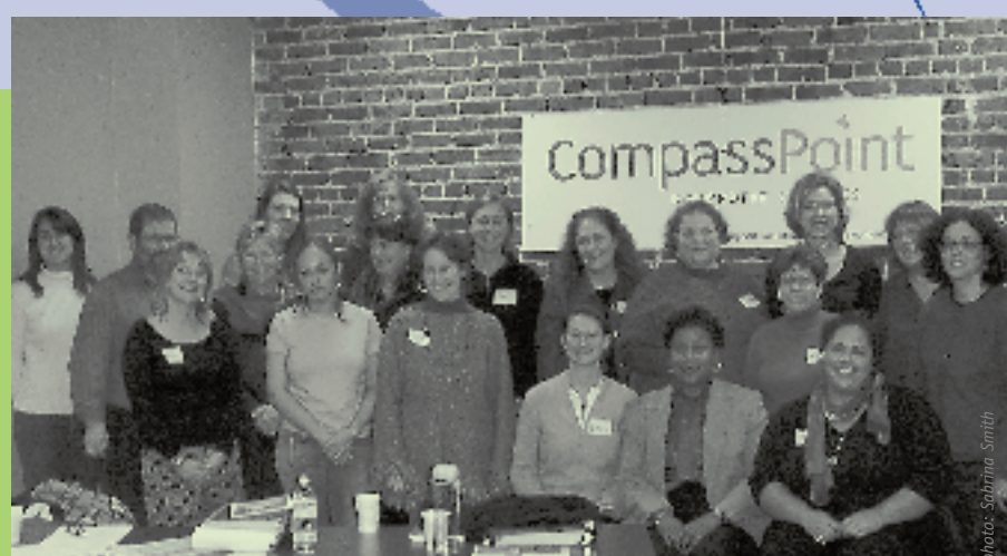
Above: The first CompassPoint class of a newly revamped Executive Director 101 management skills seminar graduated in December 2004. Participants came from a broad range of Bay Area nonprofits to study leadership, governance, fundraising, human resources and financial management.