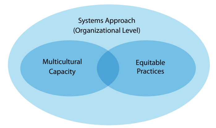
Diagram 1 This diagram shows that multicultural capacity and equitable practices are interconnected as part of a systems approach.

Organizations as Systems – Building multicultural capacity goes beyond having a diverse workforce with knowledge of and sensitivity to the communities served. The organization, as a system, must build and utilize the full potential of its workforce and tap into the strengths of the community. Many past diversity efforts have resulted in disappointment because they have failed to recognize that organizations