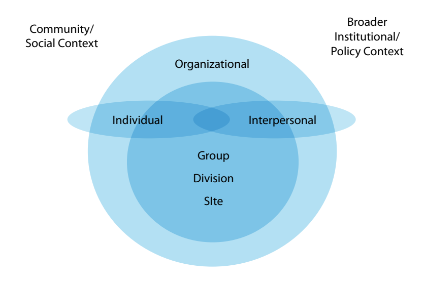
Diagram 2 Levels of Change – MCOD processes must take different levels of interaction and change into account.

Different levels of change – Organizations often focus on changing the characteristics of service delivery without strategies for organizational change. Many health and social services organizations lack values, policies, planning processes, and organizational structures to support culturally competent practice (Cohen and Goode, 1999, revised by Good and Dunne 2003). Scenario 1 shows how staff training aimed at individual awareness and knowledge can be rendered ineffective without an accompanying organizational development strategy. Organizational supports were lacking to help translate ideas from the training into organizational policy and to ensure the participation of key organizational players. Scenario 2 illustrates some of the consequences of changing the composition of the workforce without developing an organizational culture and process that values diversity. Change strategies must take into account individual, interpersonal, and organizational levels of change and how they interact with one another in the change process (Cobbs, 1994). In larger organizations with multiple divisions or sites, these levels must also be considered. Change efforts may focus on a specific entity within a large organization, rather than seeking to impact an entire organization. Furthermore, the broader community, social, and institutional context in which the organization exists must be taken into account.